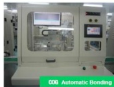
COG Automatic Bonding