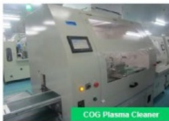
COG Plasma Cleaner