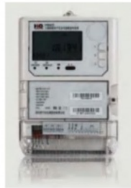
HND Electricity Meter