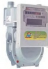
JINKA Gas Meter