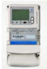
LINYANG Electricity Meter